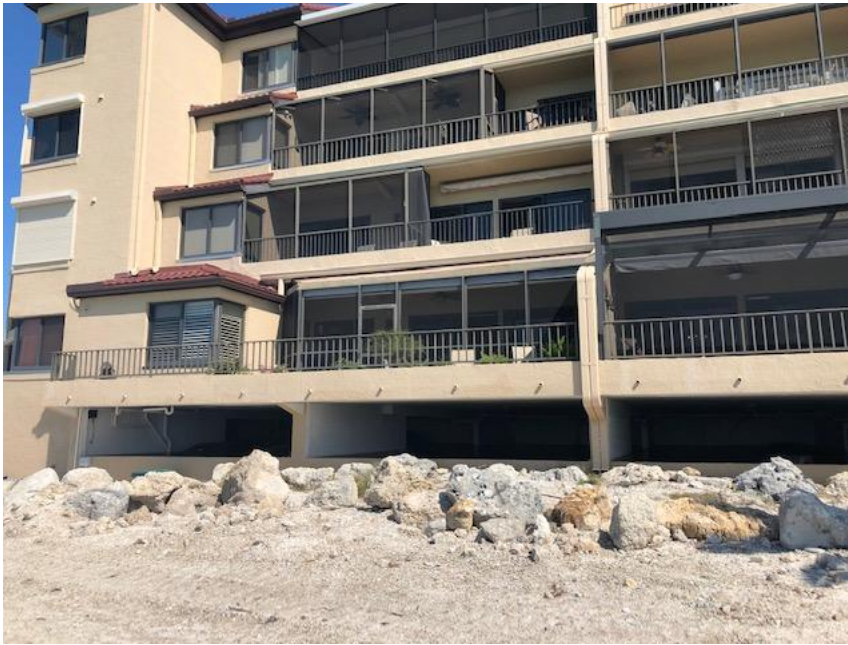
Building 600 before courtesy Karen Smith