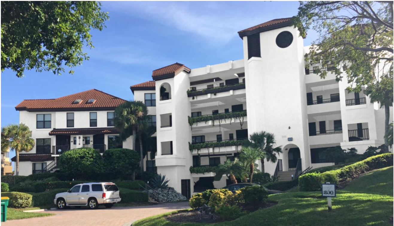
BUILDING 200 in WHITE

Big support for all white buildings! Coming soon