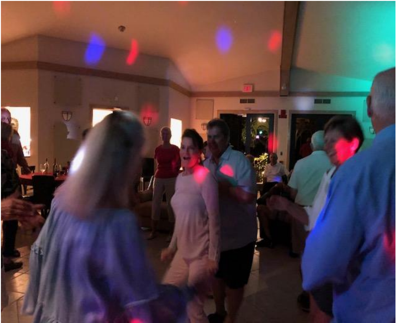
Clubhouse rocking on February valentines dance